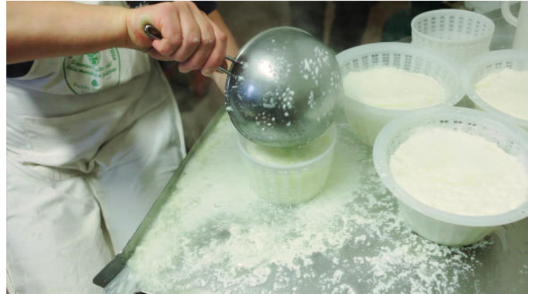
Farm - Fini Romolo (Pistoia), Italy – The dairy production

Senese”. Learners evaluated the quality of a range of feed types. During the training activities in the farm “Fini Romolo” (Pistoia) the learners were supported, coached and directed throughout the fundamental rules of converting into an effective “organic farming system” knowing the cost for certification and the consequences of violating the regulations in Italy. The farmer also presented its sheep for dairy production and the correct organic dairy process through laboratories activities, outlining the evolution of dairy sheep farming and organic production; analysing the pace, factors and impacts of development of a successful organic dairy sheep farm from North-East of Tuscany; specifying driving factors and prospects of small-scale organic farming development; assessing possibilities for replication of positive experience in other farms, and suggesting recommendations for improvement of public policies and organic farming strategies. The indoor and outdoor training activities with were led, supervised and assessed by the expert Giulio Malvezzi (Associazione Toscana Allevatori) and by experts of safety and healthy rules in the workplace from Enfap Toscana and UIL Trade Union.