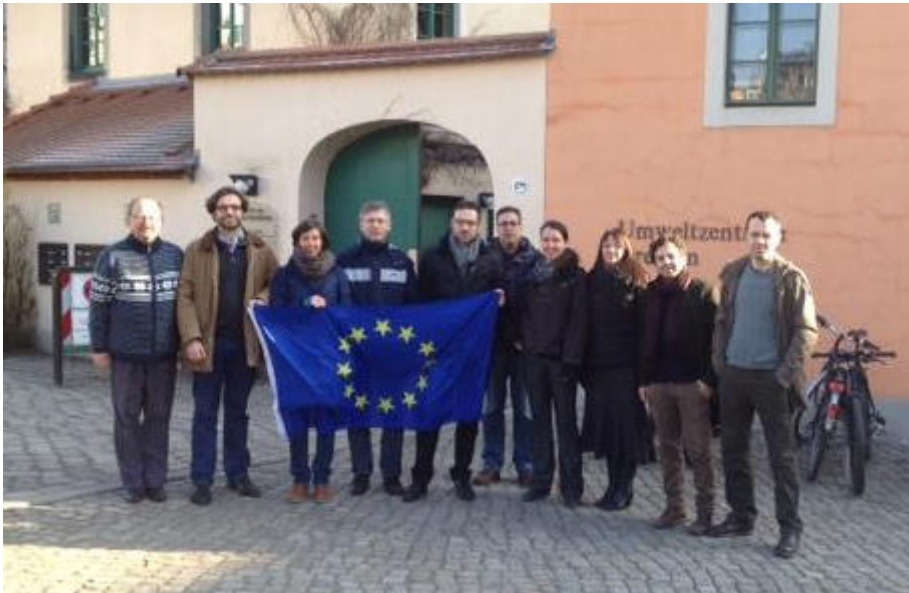
LivOrg project partners at the third partnership meeting in front of the venue in Dresden, Germany (19 th - 20 th February 2015).

During the meeting, the European project partners presented the results of the PILOT and LABS editions developed in each participating country and the instruments and methods to implement the assessment of the learning outcomes. In addition, the partners planned the effective activities to exploit the first results of the project - such as a second e-brochure, newsletter, press releases, Facebook etc. as well as enlarge the networking and the involvement of the Sector Skills Alliances stakeholder at national and local level. One dissemination and promotion workshop as well as one national focus group for exploitation per country are planned during the next months. Additionally each partner will support one to three new or aspiring entrepreneurs to apply for the EU programme Erasmus for Young Entrepreneurs, a cross-border exchange programme which gives new or aspiring entrepreneurs the chance to learn from experienced entrepreneurs running small businesses in other Participating Countries.