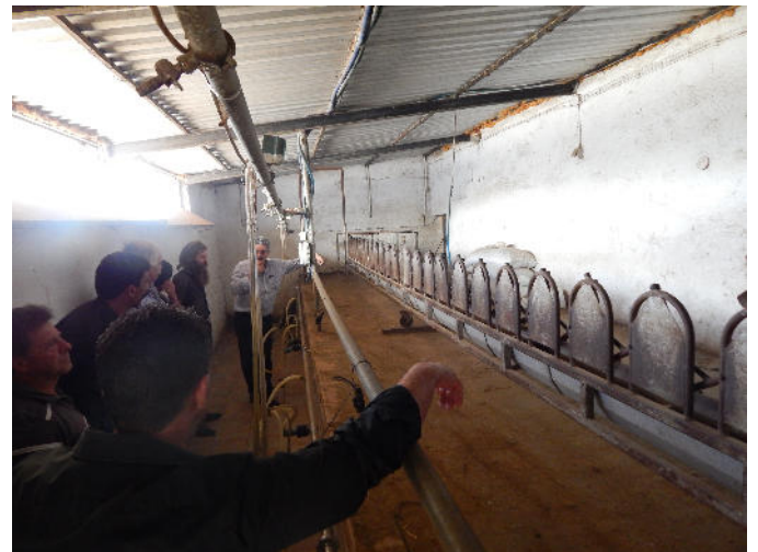
Participants of the Greek Pilot Course visiting an Organic Farm on Crete

There have been 7 days of visiting several organic livestock farms, traditional and modern (mainly sheep & goat, as well as chicken and rabbit), production units of organic yogurt and eggs, as well as representative pasture land in several parts of the island (highlands and mid-land). The activities of the Greek Pilot courses could be called very successful in terms of participation as well as in terms of general spirit and motivation. Most of the participants were full-time producer and therefore had little free time but still were highly motivated to participate in an 80 hour course about organic