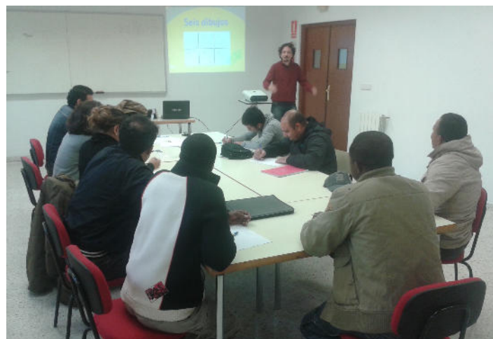
students participating in the inter-ethnic LAB in Spain

INFODEF (Institute for the promotion of development and training) organized the Inter-ethnic LAB of LivOrg project in Spain. For its development, INFODEF has had the collaboration of numerous organizations, including Local Authorities and Provincial and Regional Governments, official VET centers in organic agriculture and NGOs, all of them related to the fields of training in organic farming or the support of migrants and ethnic minorities through training and employment services.