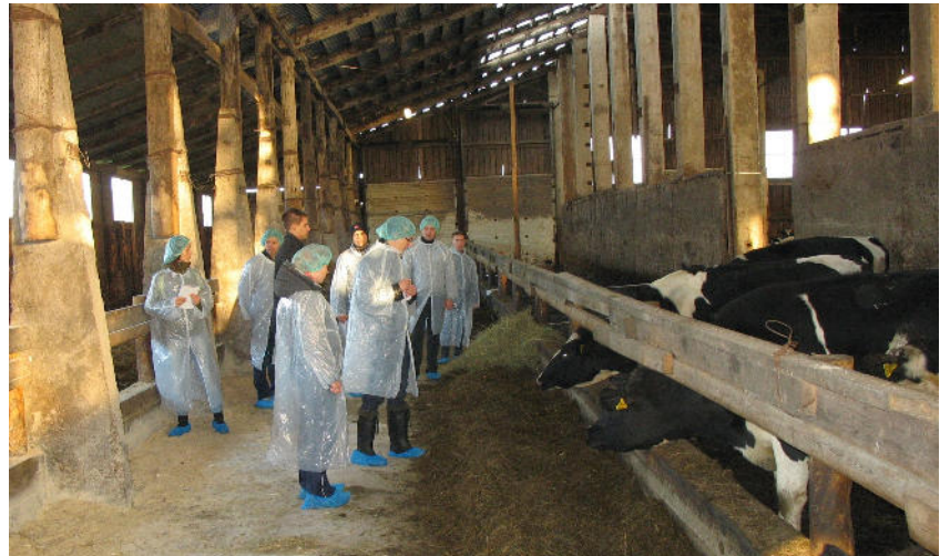
Students as experiential learners at Pajumäe organic dairy farm, Estonia

Participants were mainly students, but also young generation of farmers and other enthusiastic people who are interested in becoming organic livestock producers. During outdoor activities students visited five farms all over Estonia. In Puutsa farm in Jõgevamaa students learned about organic beef production. In Pajumäe farm in Viljandimaa organic dairy production principles and practices were studied and students visited the farm’s dairy where organic yoghurts and different cottage cheeses are made. Students also visited the biggest organic goat farm in Estonia, in Ida-Virumaa, and finally our university’s farm in Tartumaa where animal welfare was under observation. The indoor learning and farm visits with practical assignments were led, supervised and assessed by assistant professor Ragnar Leming and Prof. David Arney from Estonian University of Life Sciences.